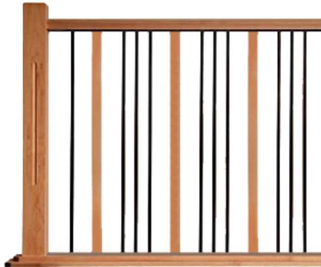
3 and 1 Wood Blank Selection